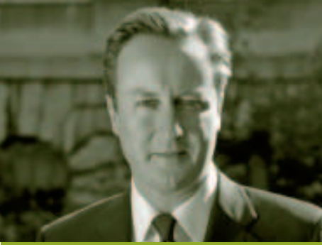
David Cameron Prime Minister